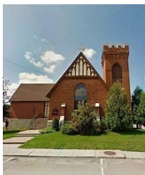
Parish of St. Paul's 96 Argyle Street Renfrew, Ontario