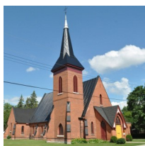
Parish of Emmanuel 287 Harrington Street Arnrior, Ontario